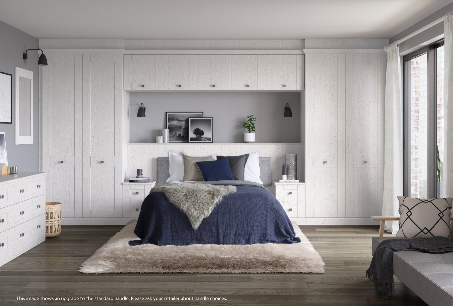
This image shows an upgrade to the standard handle. Please ask your retailer about handle choices.